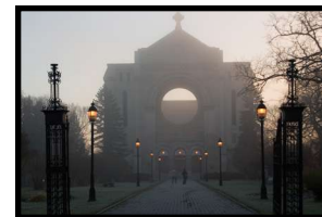
Main photo: Don Gillespie Left photo: Charlene Hurd Right photo: Charlene Hurd